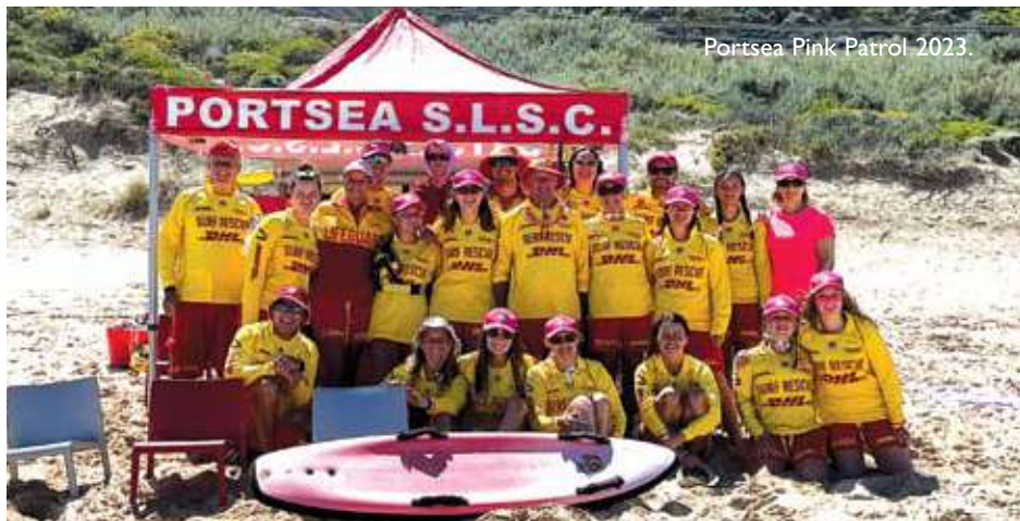
Portsea Pink Patrol 2023.