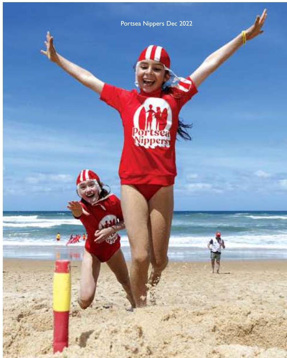
Portsea Nippers Dec 2022