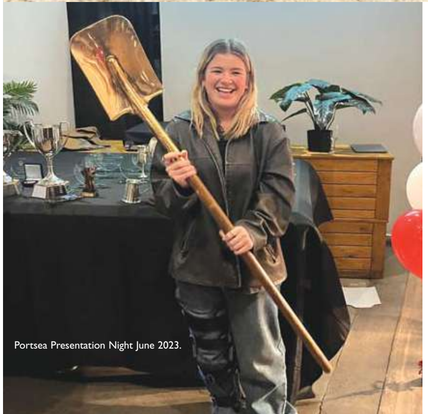
Portsea Presentation Night June 2023.