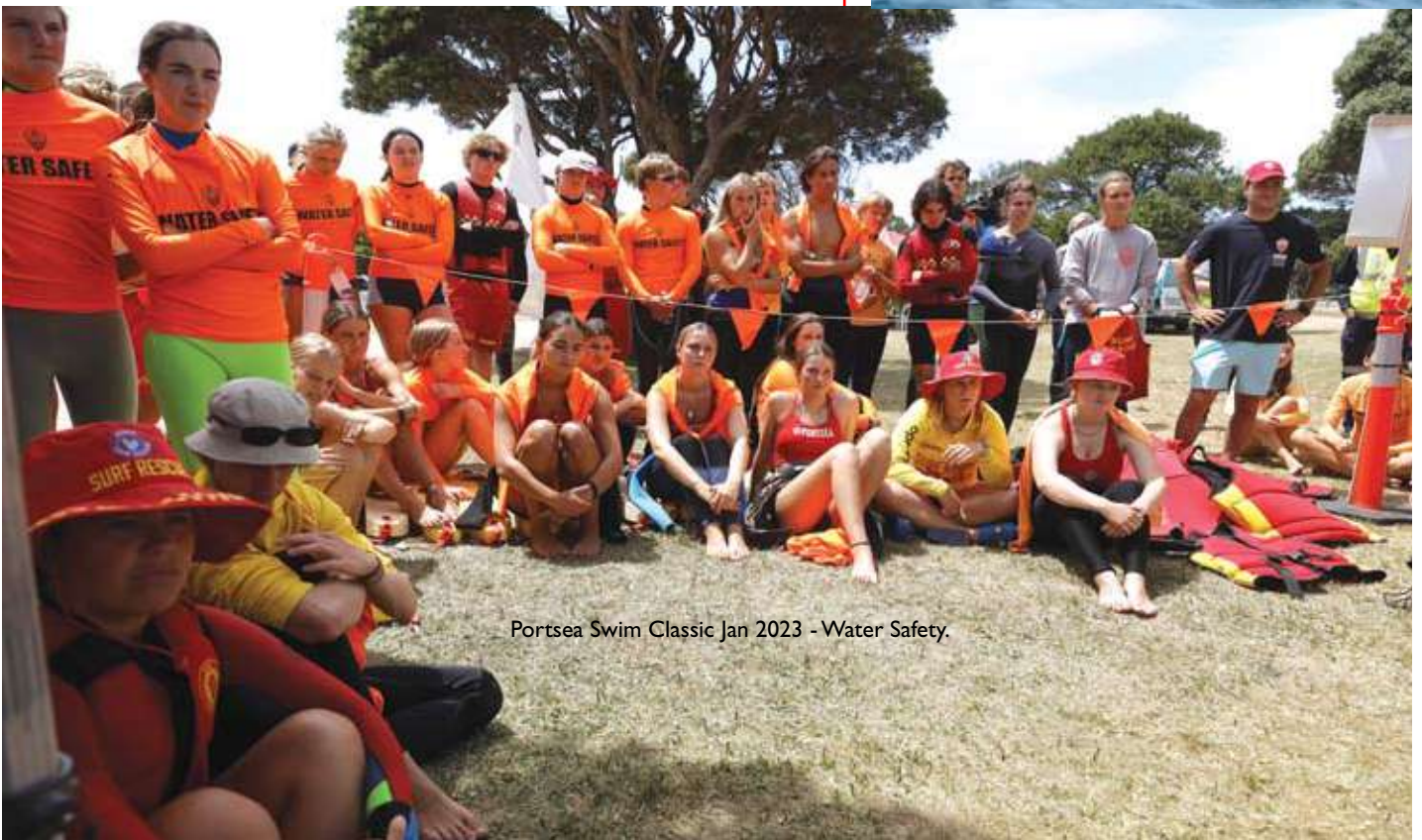
Portsea Swim Classic Jan 2023 - Water Safety.