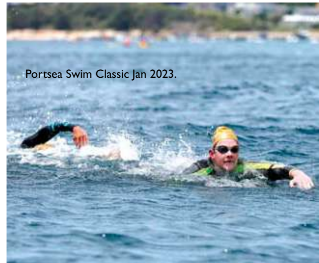
Portsea Swim Classic Jan 2023.