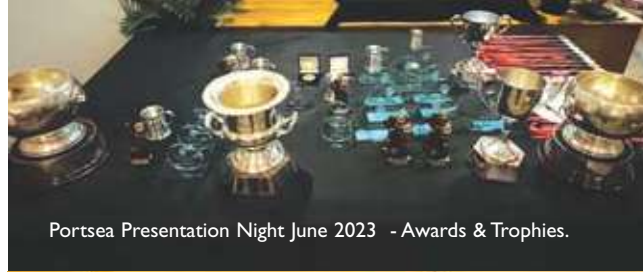
Portsea Presentation Night June 2023 - Awards & Trophies.