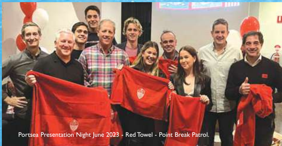
Portsea Presentation Night June 2023 - Red Towel - Point Break Patrol.