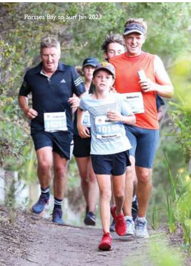
Portsea Bay to Surf Jan 2023

Portsea All Stars Golf Day Event Director