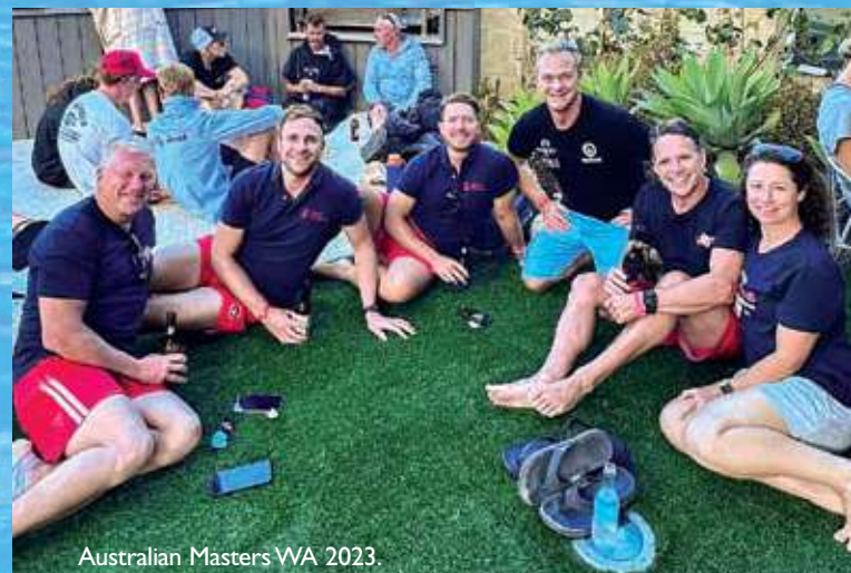
Australian Masters WA 2023.

Thanks to our officials, water safety and event organisers, and to the weather gods for such a beautiful day.