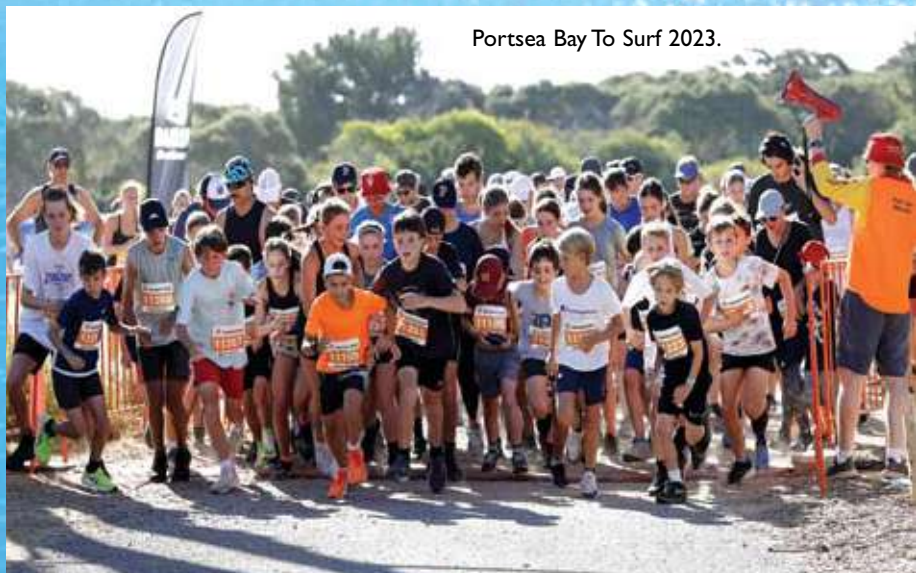
Portsea Bay To Surf 2023.