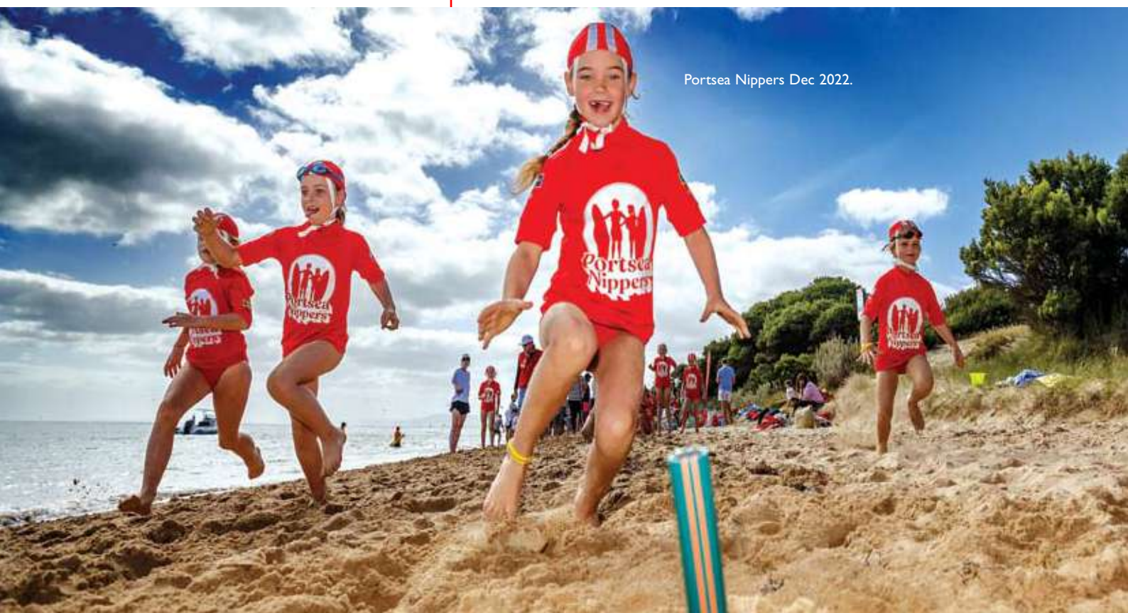
Portsea Nippers Dec 2022.