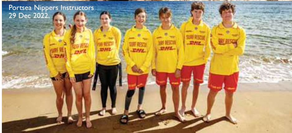
Portsea Nippers Instructors 29 Dec 2022.