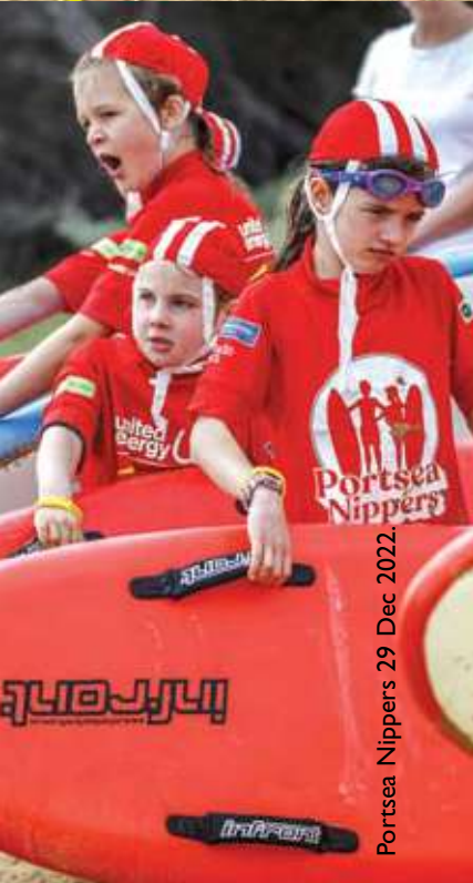
Portsea Nippers 29 Dec 2022.