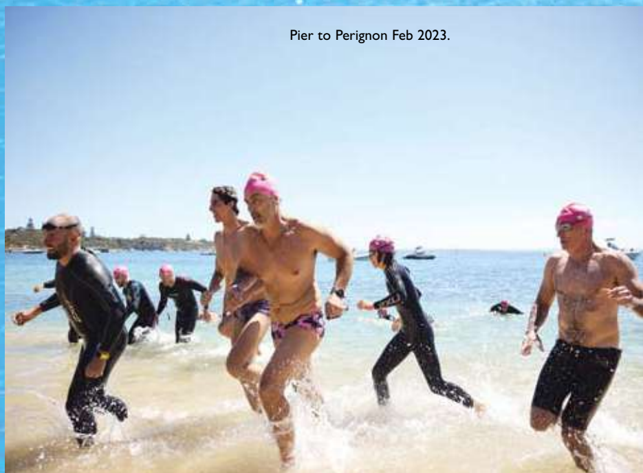
Pier to Perignon Feb 2023.