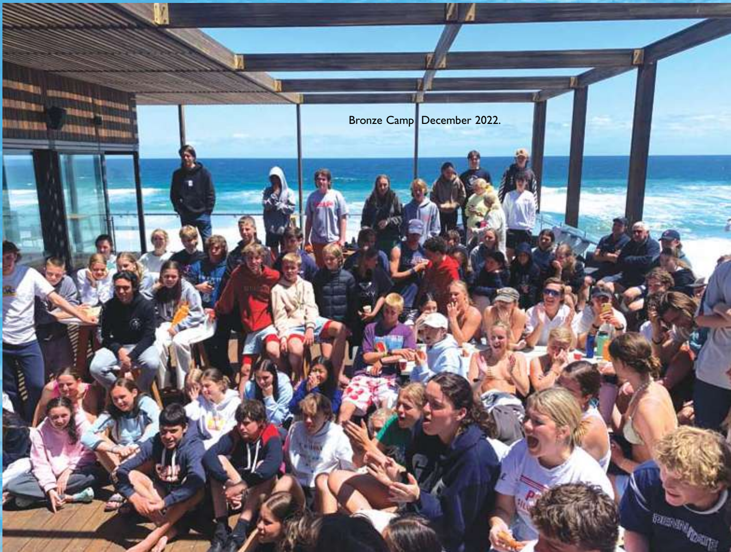
Bronze Camp December 2022.