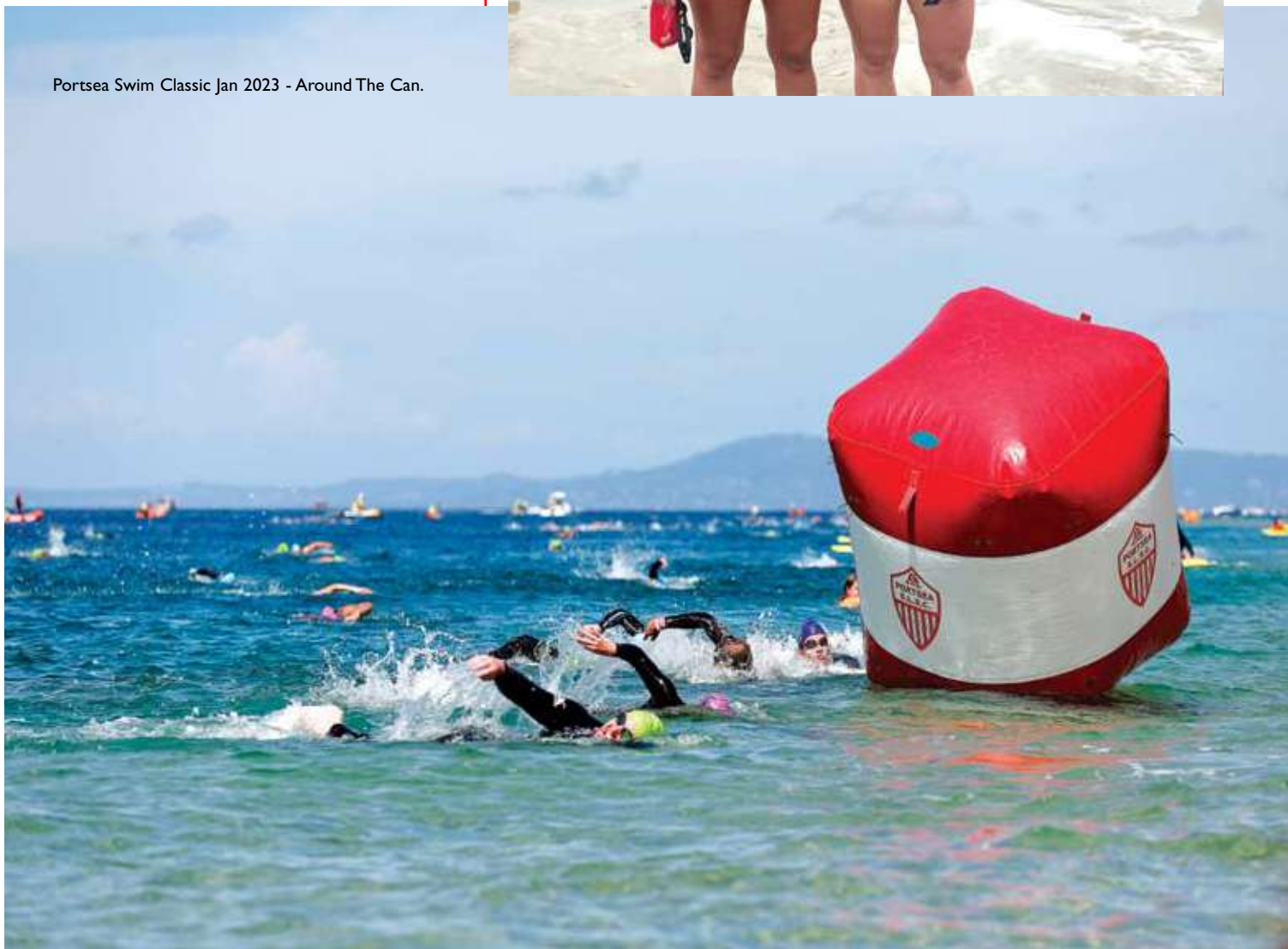
Portsea Swim Classic Jan 2023 - Around The Can.