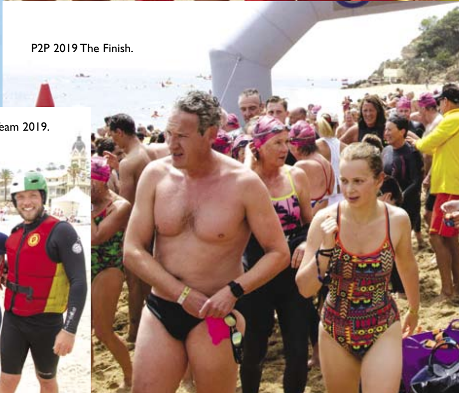
Portsea IRB Team 2019.