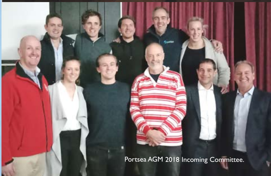
Portsea AGM 2018 Incoming Committee.