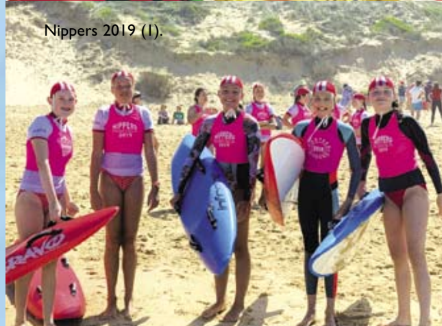
Nippers 2019 (I).