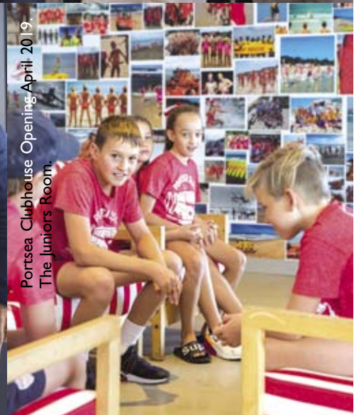
Portsea Clubhouse Opening April 2019 - The Juniors Room.