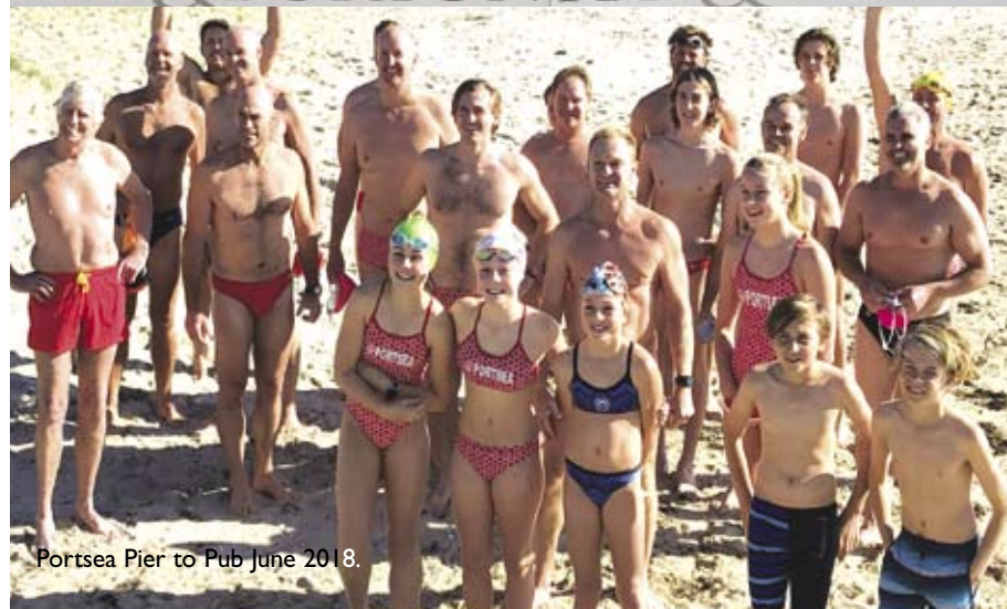
Portsea Pier to Pub June 2018.