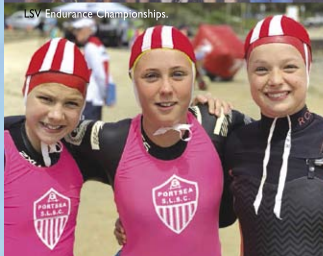
LSV Endurance Championships.