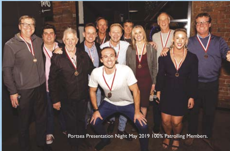
Portsea Presentation Night May 2019 100% Patrolling Members.