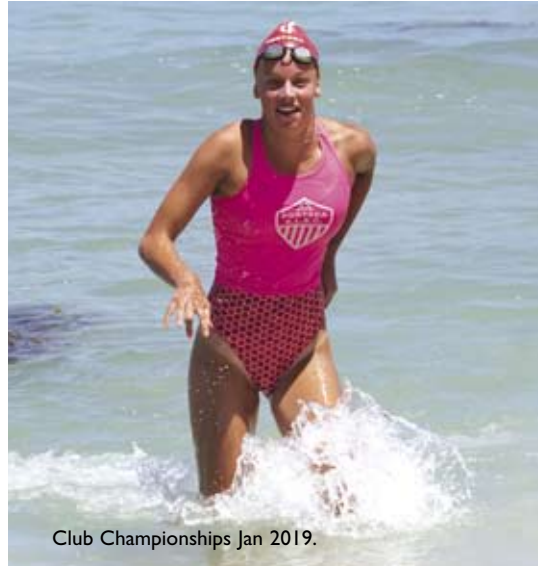
Club Championships Jan 2019.