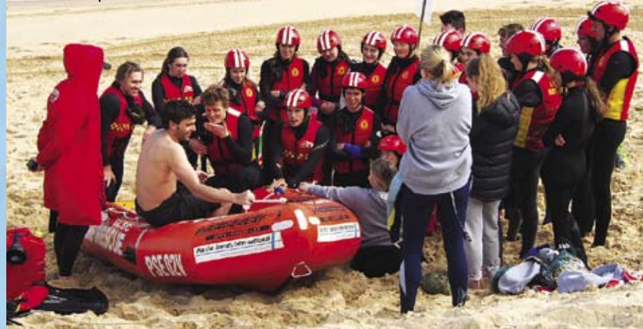
Silver Camp 2018 Students.