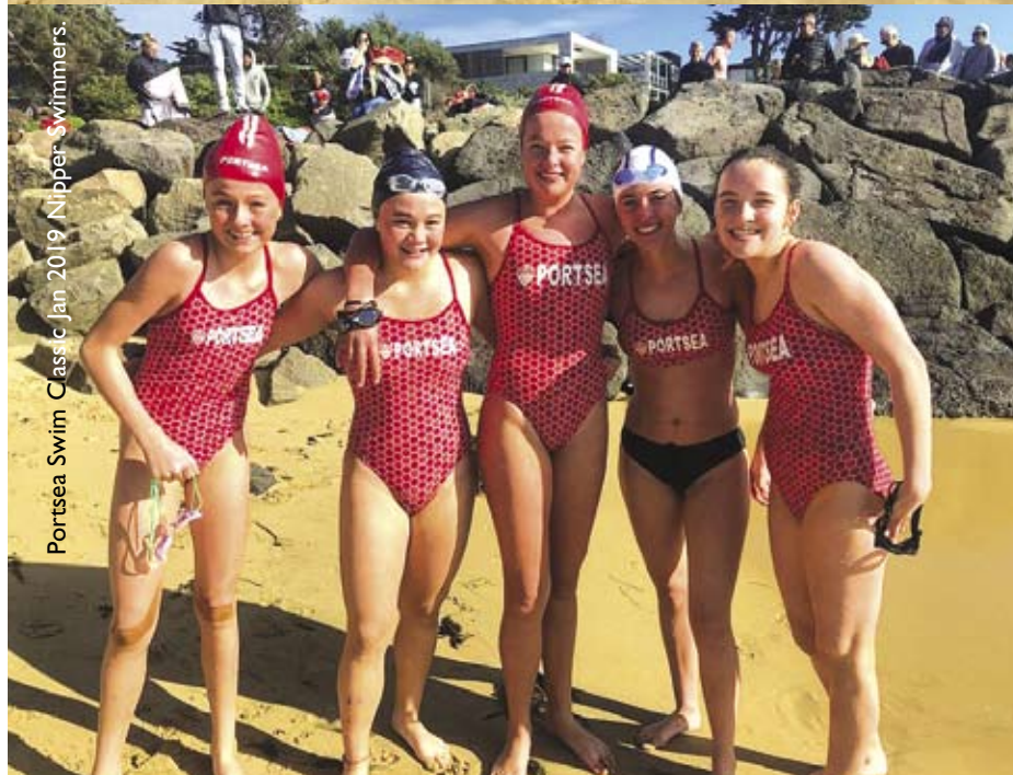
Portsea Swim Classic Jan 2019 Nipper Swimmers.