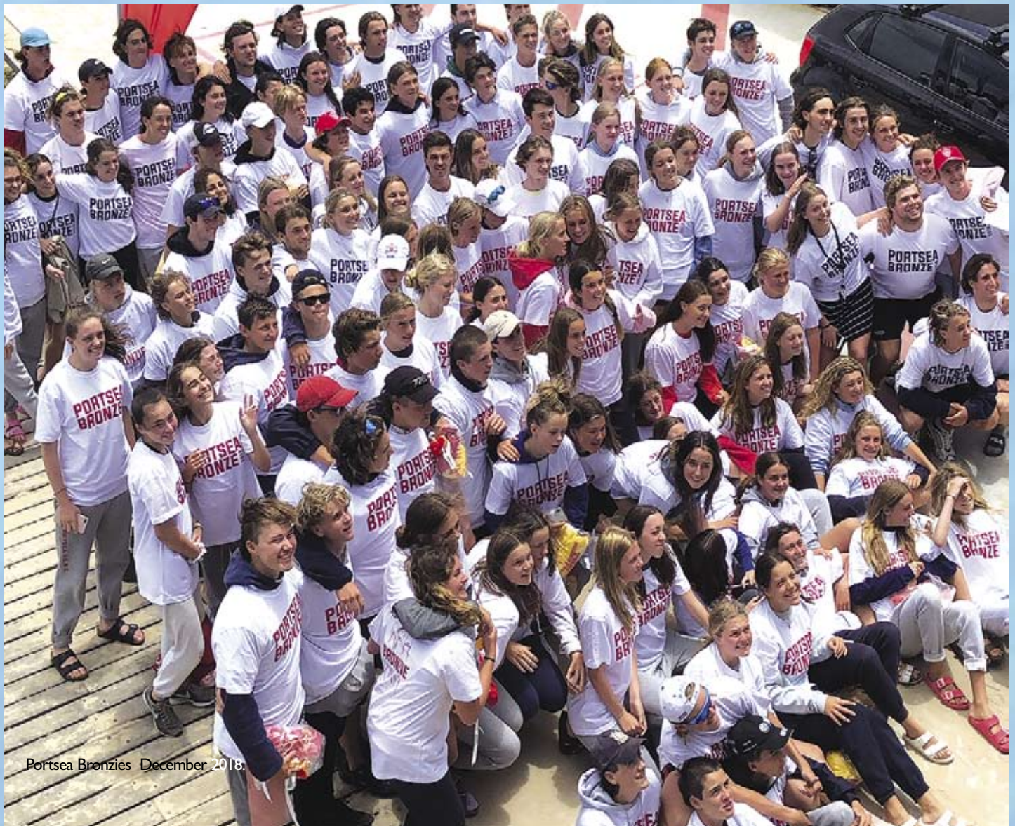
Portsea Bronzies December 2018.