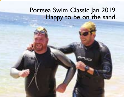
Portsea Swim Classic Jan 2019. Happy to be on the sand.