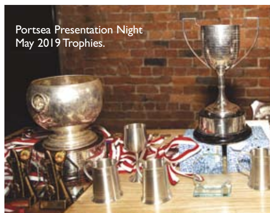
Portsea Presentation Night May 2019 Trophies.