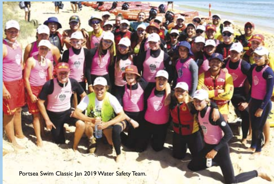
Portsea Swim Classic Jan 2019 Water Safety Team.