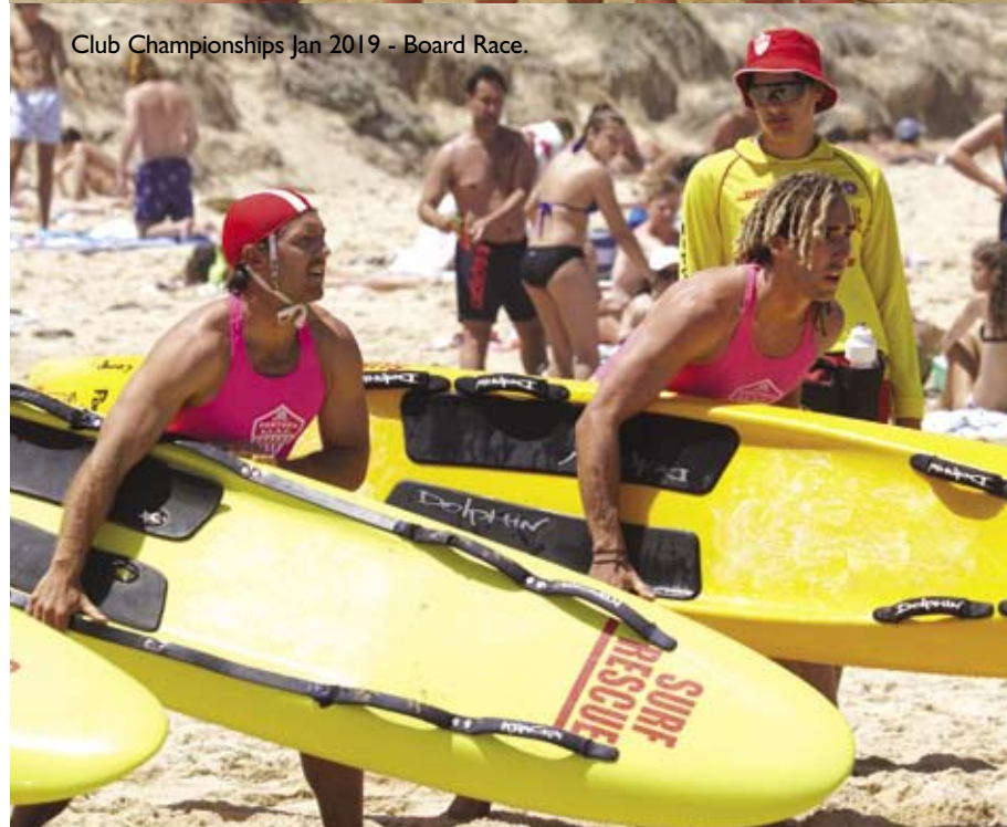
Club Championships Jan 2019 - Board Race.