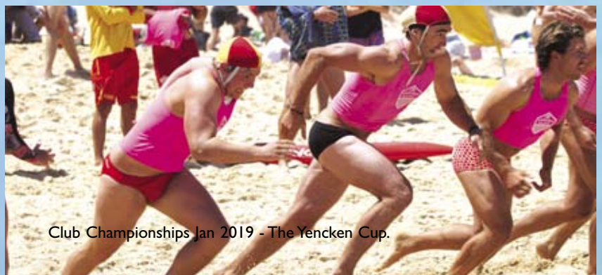
Club Championships Jan 2019 - The Yencken Cup.