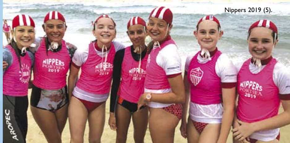
Nippers 2019 (5).