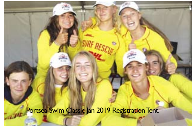
Portsea Swim Classic Jan 2019 Registration Tent.