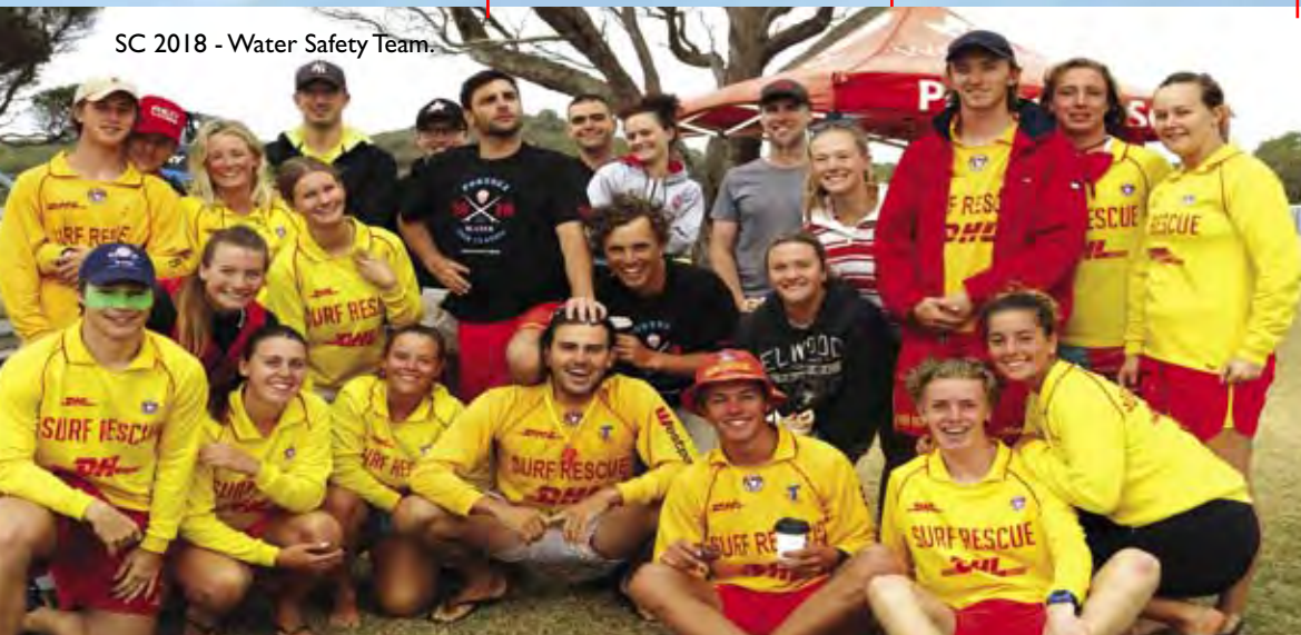
SC 2018 - Water Safety Team.