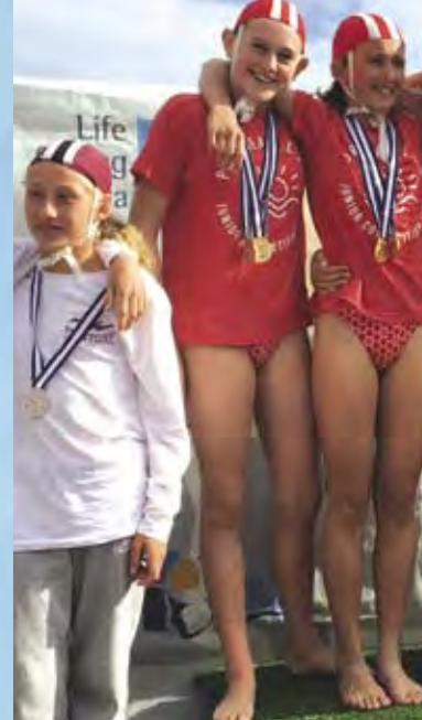
Nippers 2018 U12 girls swim team GOLD medal.