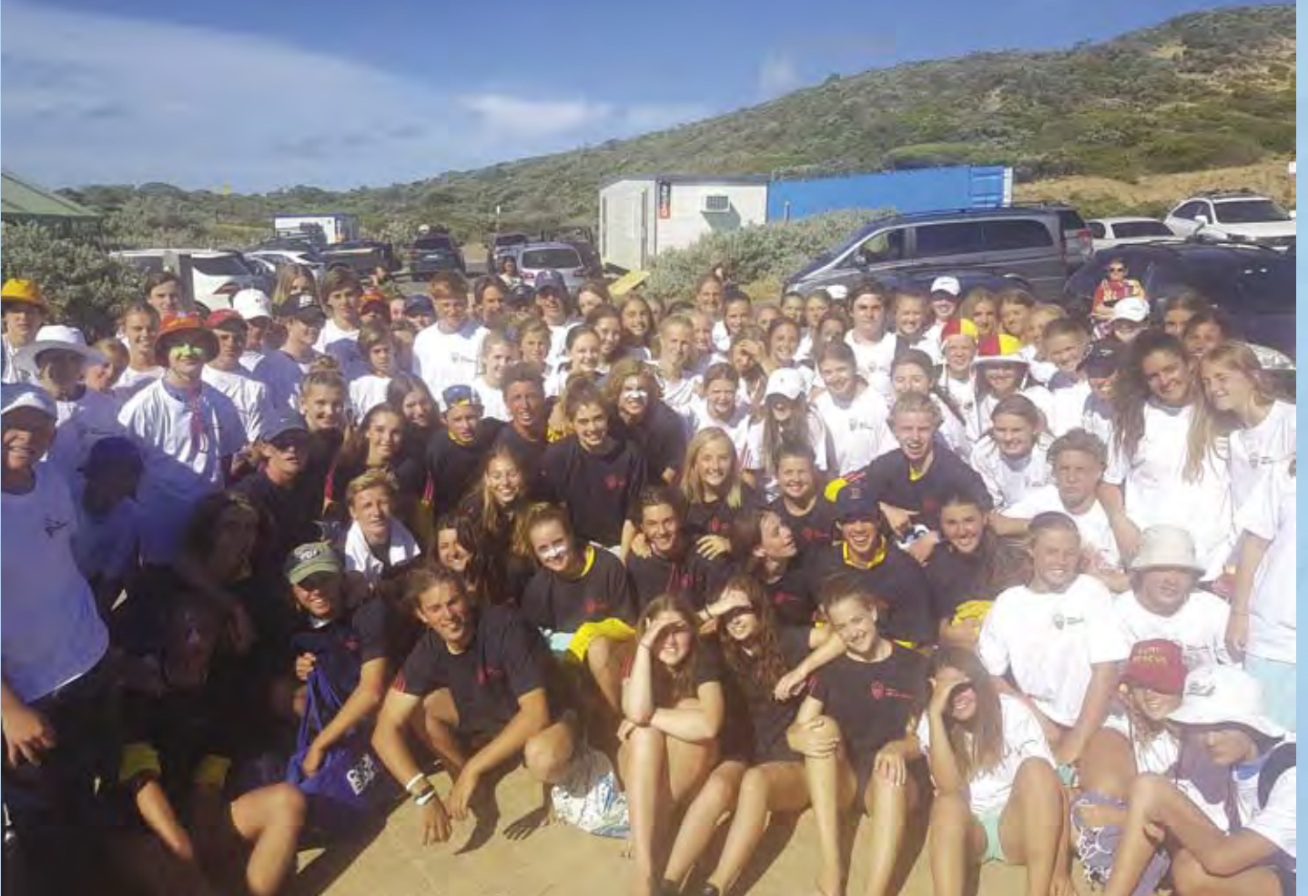
Cadet Camp 2018.