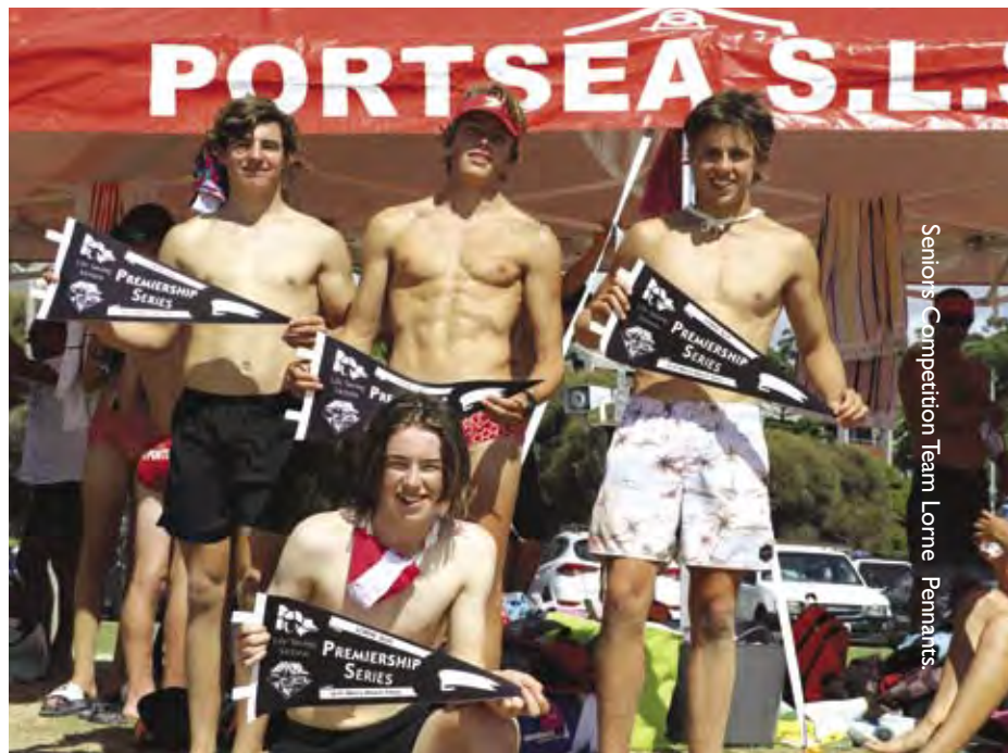
Seniors Competition Team Lorne Penrynats

Thanks to our Chiefs, Senior instructors and camp organisers once again for their help, in addition to Portsea Camp, who took us on board with open arms!