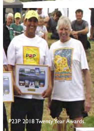
P23P 2018 Twenty Year Awards.