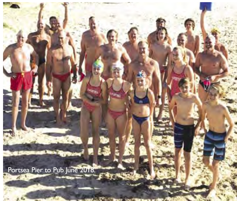
Portsea Pier to Pub June 2018.