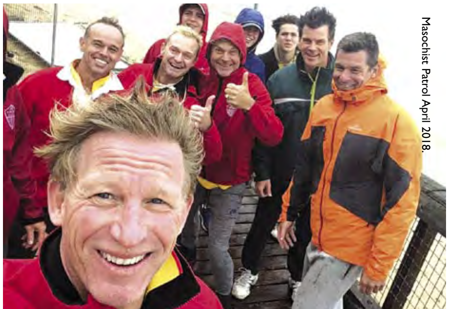
Masochist Patrol April 2018.