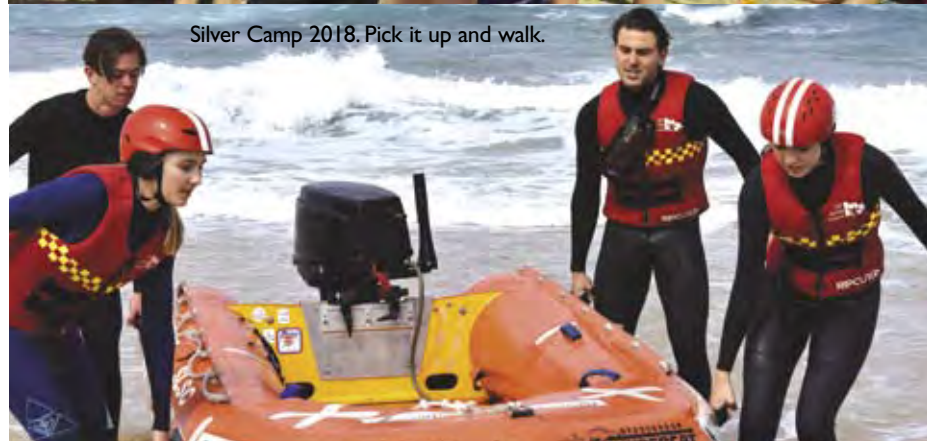
Silver Camp 2018. Pick it up and walk.