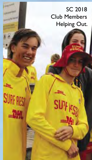
SC 2018 Club Members Helping Out.